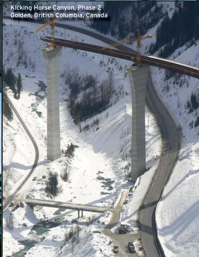
Kicking Horse Canyon, Phase 2 Golden, British Columbia, Canada