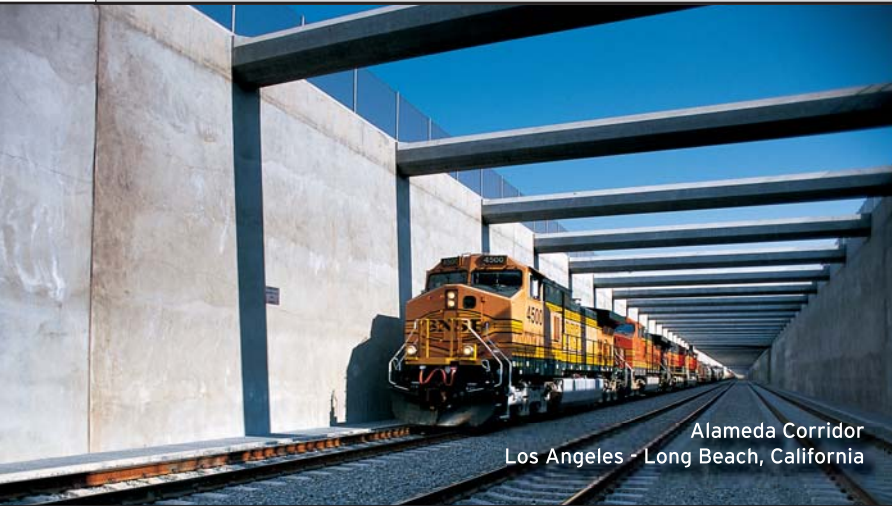
Alameda Corridor Los Angeles - Long Beach, California