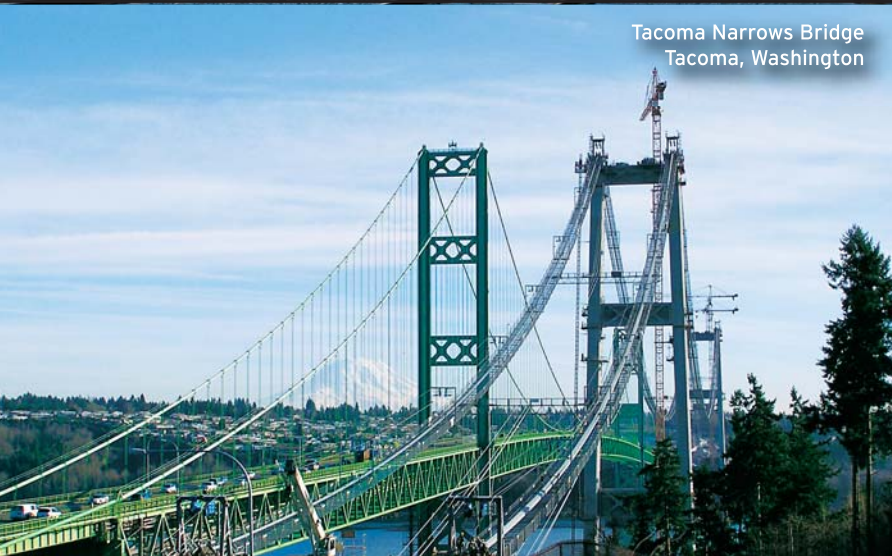
Tacoma Narrows Bridge Tacoma, Washington