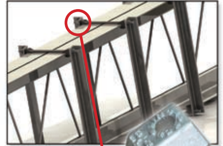
Type CF - High Friction Clamp