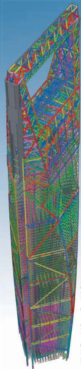
Model: Financial Center, Shanghai, China

In addition to improved design efficiency, drawing output, change management, and multi-user collaboration, Tekla Structures software easily integrates with other systems, such as architectural, MEP process layout, and structural analysis & design solutions. The structural model that you create is used by detailers, steel fabricators, precast manufacturers, and contractors. Use the same model to save time and to ensure quality projects, which benefit everyone involved. Tekla Structures is the one tool that does the job from conceptual design all the way to detailing, construction and site management. Contact Tekla US for more information, call 1-877-TEKLA-OK