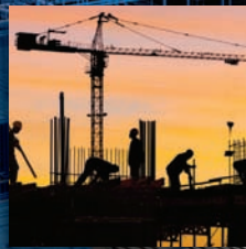
Scheduling & Sequencing