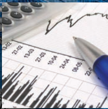
Cost Estimation & Code Checking

DCS offers has experience on a range of project deliverables, including cost estimating, standard template design, electronic collaboration and data exchange, sequencing and scheduling, work process analysis and asset management. Our clients include: International Code Council (ICC), Autodesk, and the U.S Department of State.